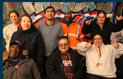
Leisure Link Social