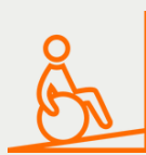
RAMPED/SLOPED ACCESS, AND/OR MANUAL DOORS