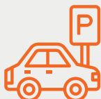
ON SITE PARKING