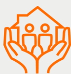
SAFE / QUIET SPACE AVAILABLE