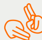
STAFF TRAINED IN SIGN LANGUAGE