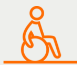
LEVEL ACCESS AND AUTOMATIC DOORS (OR NO DOORS)