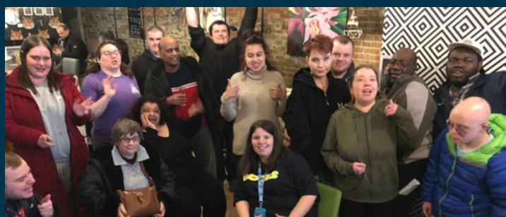
Leisure Linkers at Riff Ruffs social