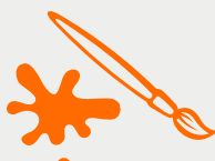
ARTS + CRAFTS