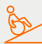
RAMPED/SLOPED ACCESS THAT IS LONG/STEEP (MAY HAVE MANUAL DOORS)