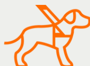
FACILITIES FOR ASSISTANCE DOGS