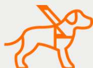
FACILITIES FOR ASSISTANCE DOGS